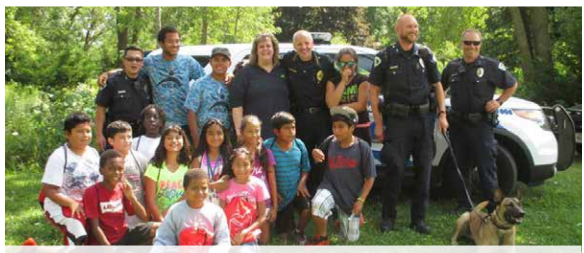
Allied Drive Summer Camp Program

The department also regularly includes external stakeholders in selection processes for specialized officer positions.