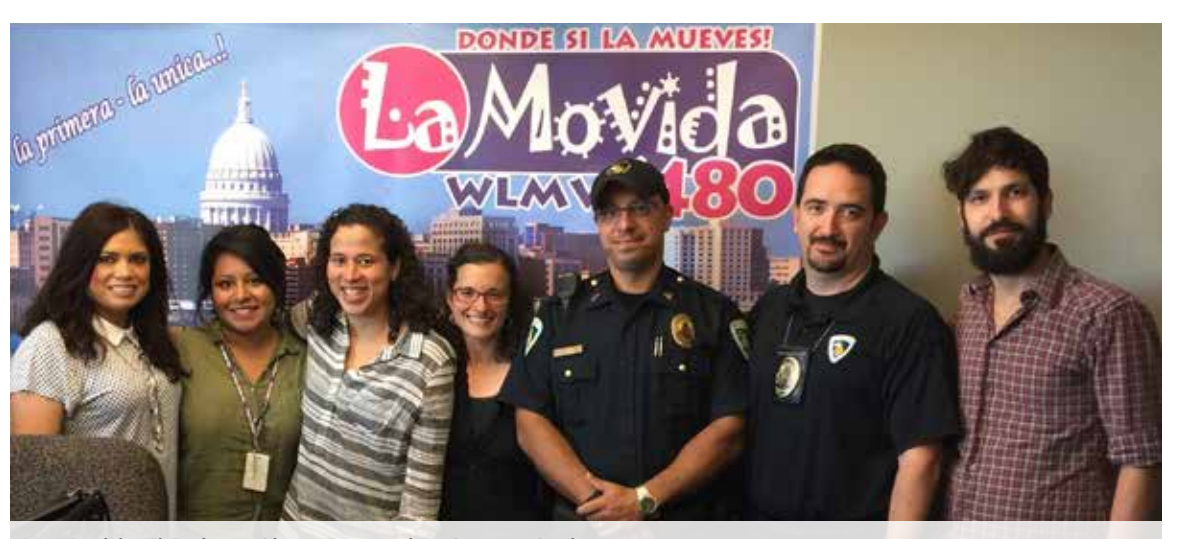
La Movida El Debate Show Promoting Soccer Series

MPD also has posted its Mission Statement, Core Values and Code of Conduct. These have been on our website for years.