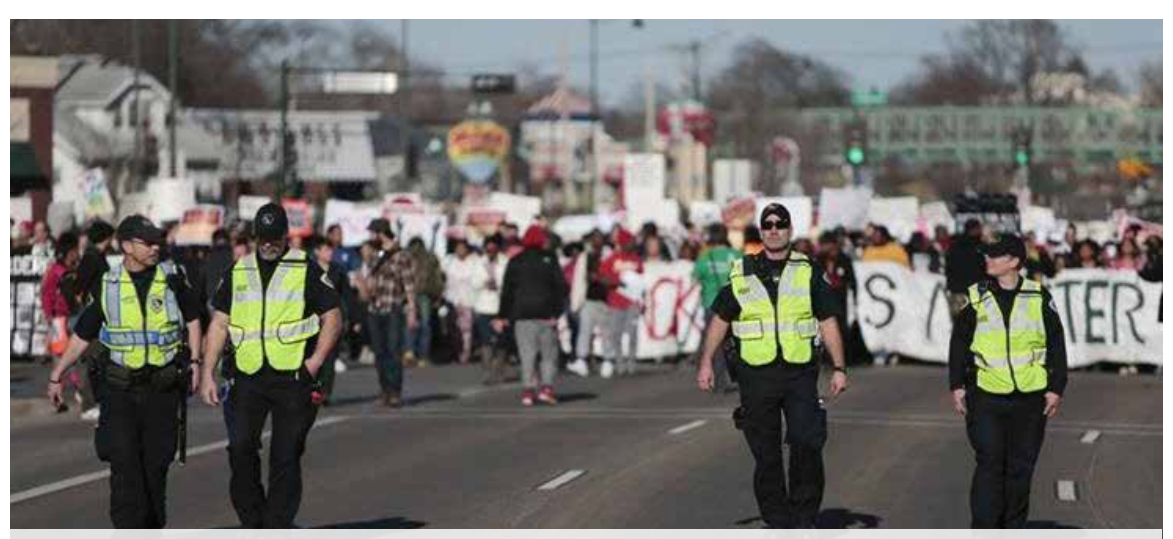
Special Events Team (SET)

The U.S. Department of Justice, through the Office of Community Oriented Policing Services and Office of Justice Programs, should provide technical assistance and incentive funding to jurisdictions with small police agencies that take steps towards shared services, regional training, and consolidation.