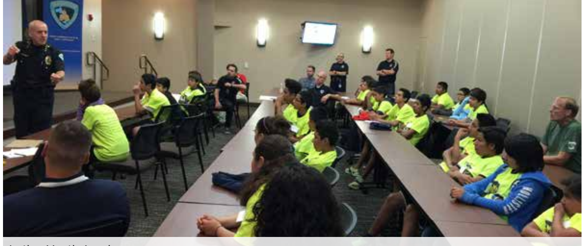
Latino Youth Academy

Also, the Professional Standards and Internal Affairs (PS&IA) Office posts quarterly discipline summaries to the MPD website. These summaries include investigations leading to discipline each quarter and a short summary of what they were disciplined for. In high profile cases, the PS&IA office may send out a separate media summary with a summary of the incident and what the officer was disciplined for.