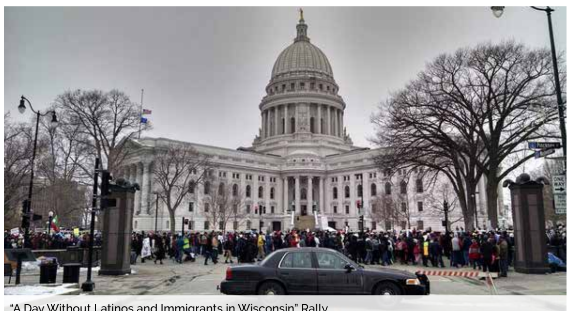
"A Day Without Latinos and Immigrants in Wisconsin" Rally

input, we restructured the use of force policies in order to provide more clarity. Use of force data is posted to the MPD website on a quarterly basis.