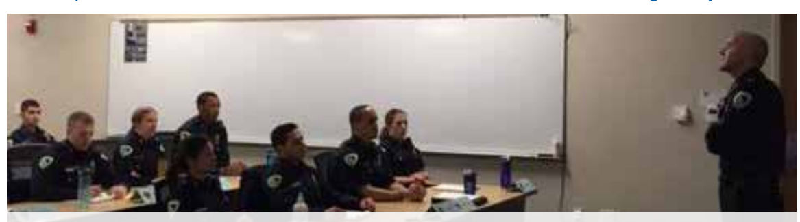
Recruits in Training Academy

In 2016, a new MPD Use of Force Coordinator position was created. This position is currently staffed by a Sergeant with State of Wisconsin Master Instructor certifications in Defense and Arrest Tactics and Firearms training. Responsibilities of the Use of Force Coordinator include: reviewing every MPD