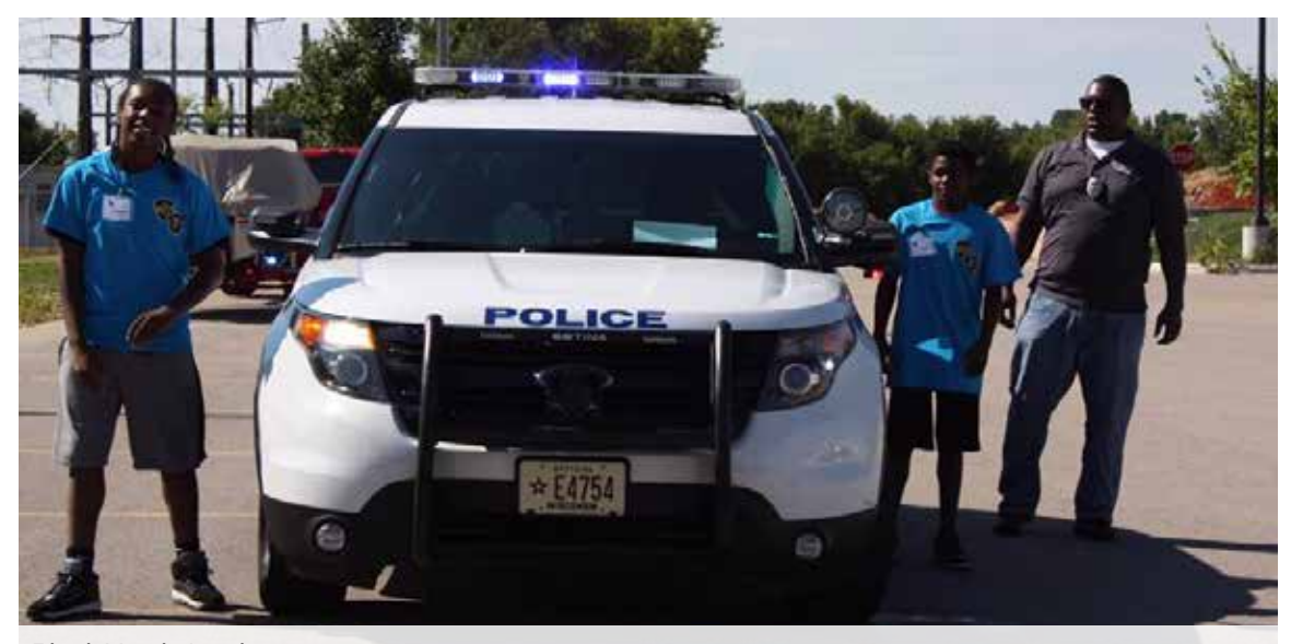
Black Youth Academy

MPD supports accountability for departmental outcomes.