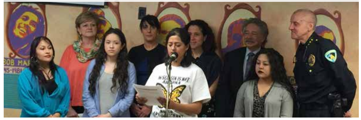
Centro Hispano Forum in support of Voces de la Frontera