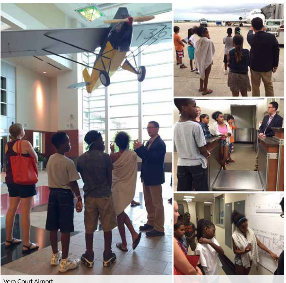
Vera Court Airport