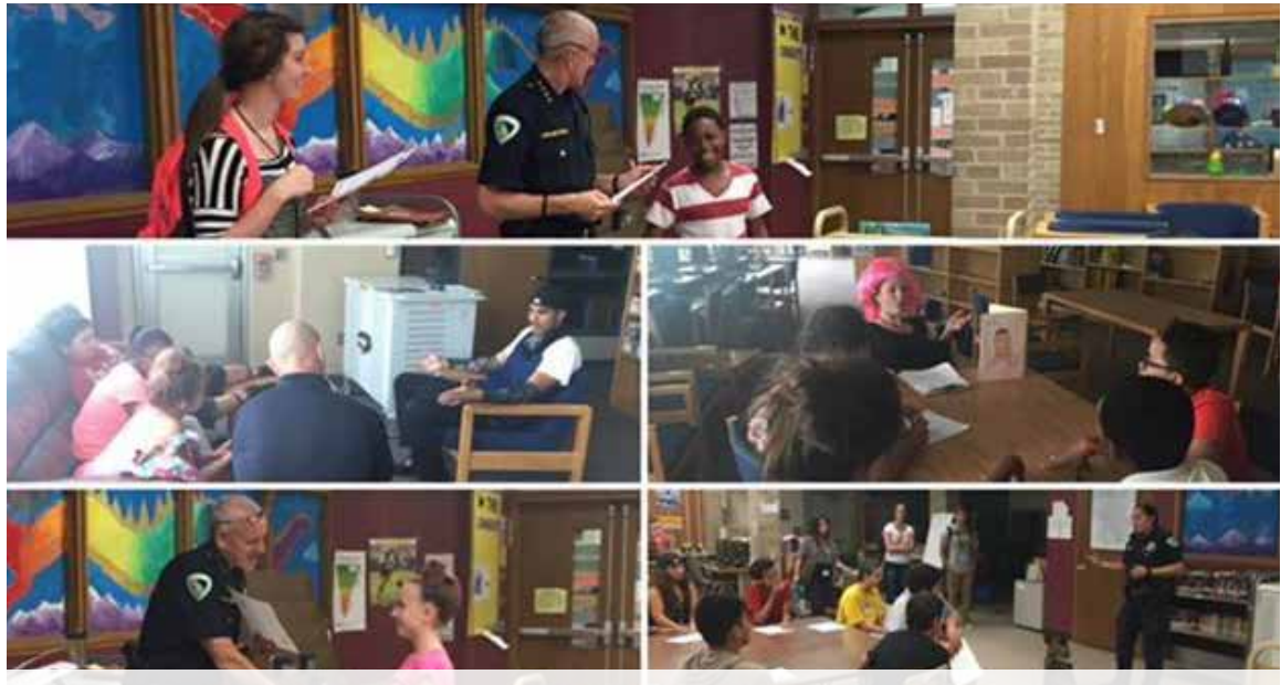
Madison School and Community Recreation Students with MPD

Explorer Post, Amigos en Azul, and other such efforts further our commitment to creating opportunities to positively connect with our youth. Recurring events like the Summer Soccer Series, Chat with a Cop and Craft with a Cop offer additional informal and non-traditional opportunities for youth and police officers to interact. The department's Community Outreach and Resource Education Team (CORE)—created using federal grant funds—is taking on increased responsibility for coordinating and planning many of these initiatives. These efforts and the positive outcomes they yield are publicized through the Chief's Blog, the MPD website, Facebook, and Twitter.