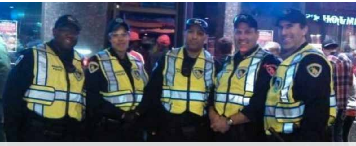
Special Events Team (SET)

Recent in-service and specialized training topics have covered the issues related to heroin and opiate addiction, and the impacts to public safety.