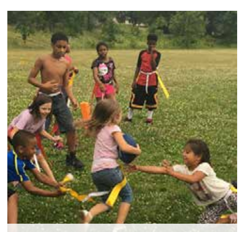
Flag Football Event