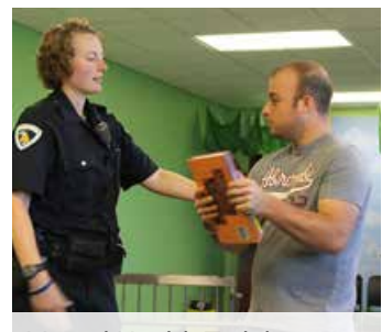
Mental Health Training

MPD continues to work with our City Employee Assistance Program (EAP) coordinator to develop and provide training in the area of officer resiliency. A number of resiliency-based programs exist that help educate officers about the stress reactions to trauma and other critical incidents that many first responders experience. In conjunction with EAP staff, our Peer Support Team will explore these resiliency training offerings and take steps to provide this type of training to our personnel.