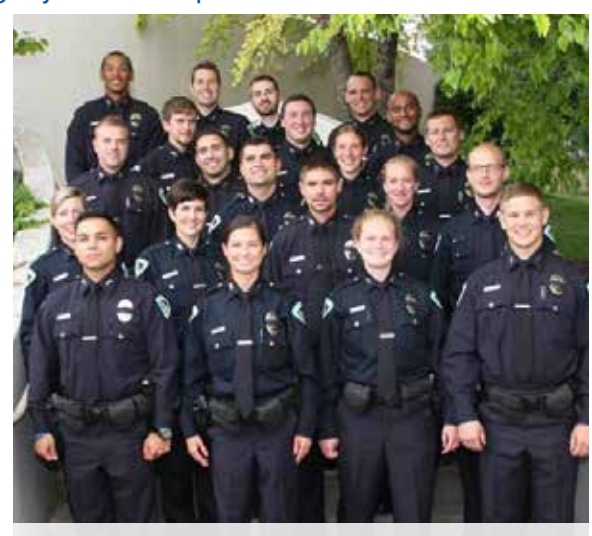
2015 Recruit Class

Anecdotally, a higher percentage of the applicants who failed were women—many of which were women of color. These applicants did not have experience with "protocol perfect pushups." Beginning in the 2017 hiring cycle, the process was modified so that applicants could retake the physical agility within the same cycle, thus