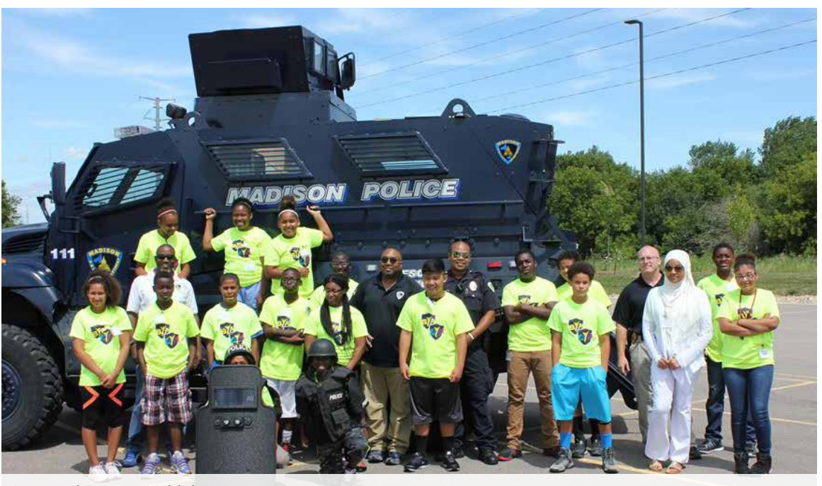
Armored Rescue Vehicle