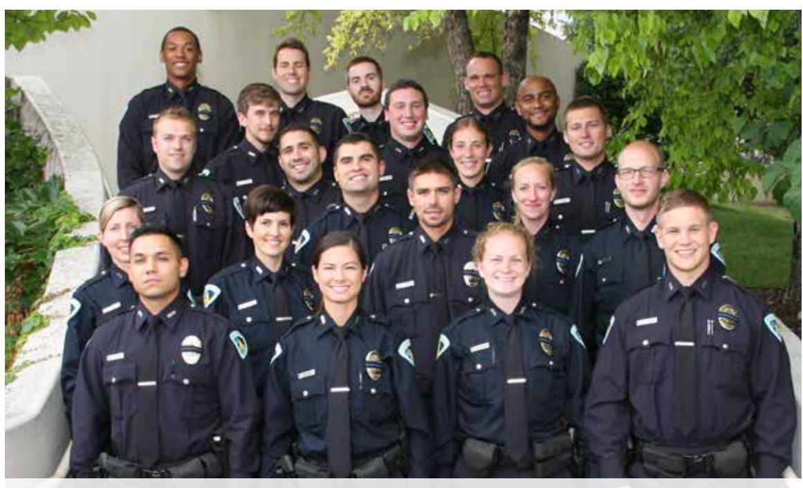
2015 Recruit Class Graduation

Future trainings will focus not just upon how the courts have allowed police to act, but rather focus on the legal, moral, and ethical way we should police our community. A lecturer from the UW Law School Innocence Project also presents at the Academy. During the Interview block of instruction pertinent research influenced by the Innocence Project (the fallibility of eye witness identification) was presented to the 2017-18 recruit class.