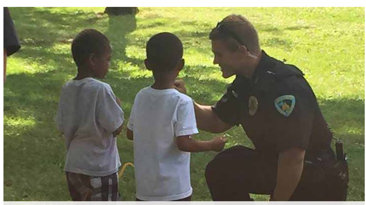
Meeting Community Members

The Madison Metropolitan School District has developed comprehensive programs to address these issues. MPD continues to support these efforts. MPD continues to work closely with the Dane County Restorative Court and is the leading referral agency for this program. In 2016, MPD has expanded the geographic scope to include all five police districts (started with only the South District) and as a result, an increase in referrals from across all of Madison occurred during 2017. The MPD also continues to collaborate with the YWCA Circles program, TimeBank Peer Court and the Briarpatch Youth Peer Court. MPD would also welcome additional community-based programs for youth.