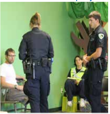
Mental Health Training

Our Officer-Involved Critical Incident procedure addresses the unique concerns of officers and employees who have been involved in a critical incident as a witness,