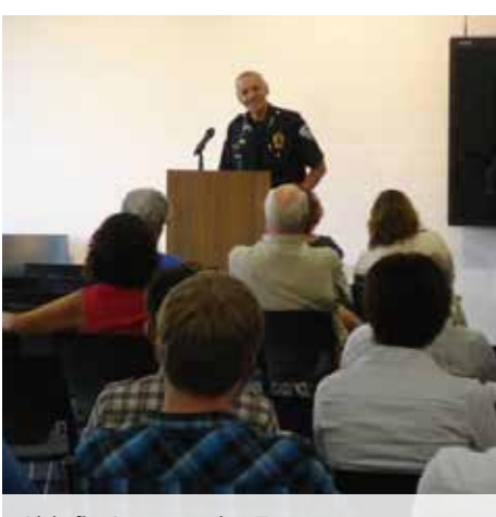
Chief's Community Forum

MPD attends staff meetings on future development projects within the City. Information is shared with the affected district so that further input and collaboration can occur on the project proposal. MPD also participates in the Neighborhood Resource Teams (NRT) throughout the City.