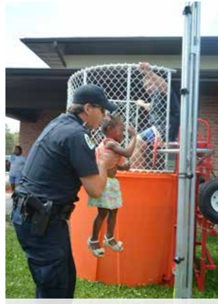
Eastside Community Fun Fest

The Federal Government should create a Law Enforcement Diversity Initiative designed to help communities diversify law enforcement departments to reflect the demographics of the community.