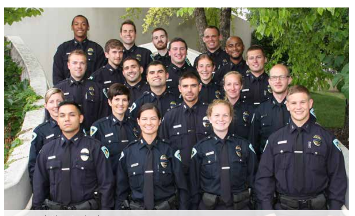
2015 Recruit Class Graduation

The Federal Government should support research into the development of technology that enhances scenario-based training, social interaction skills, and enables the dissemination of interactive distance learning for law enforcement.