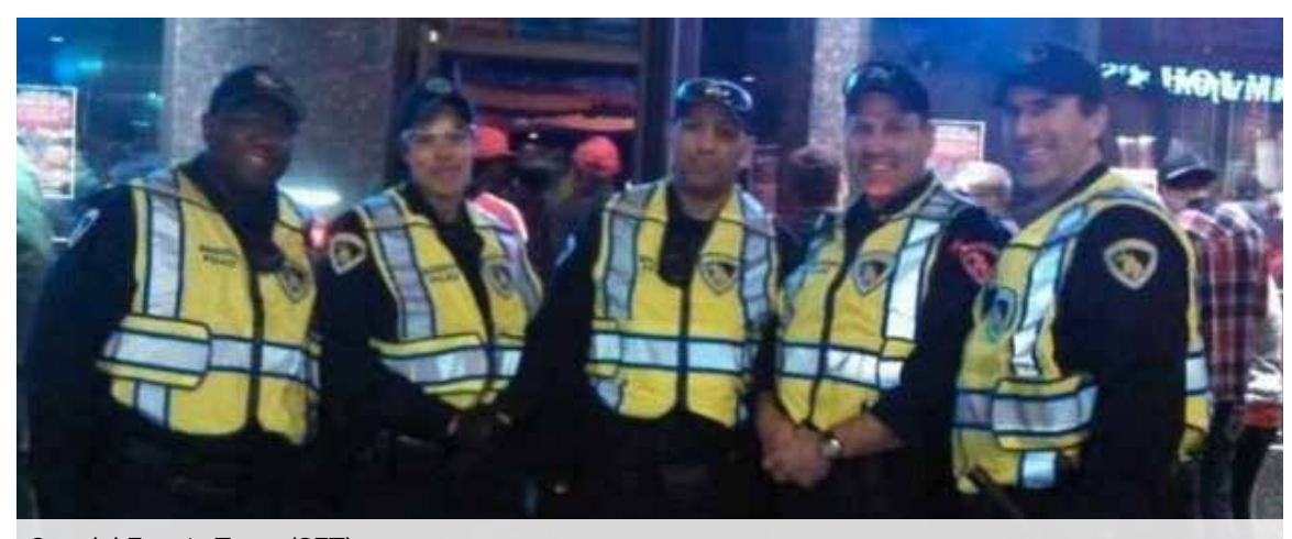
Special Events Team (SET)

MPD CURRENT STATUS: The State of WI LESB requires eight hours of cultural competency training for new officers. The MPD pre-service academy receives twenty-eight hours of curriculum related to cultural competency and implicit bias. This training is continued via in-service requirements as well as optional specialized training. Community members/organizations have frequently been utilized, as well as professional academics that specialize in implicit bias research. It is recognized that addressing human implicit bias takes life-long learning.