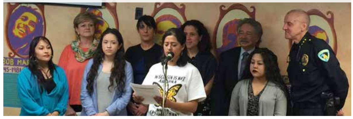
Centro Hispano Forum in support of Voces de la Frontera