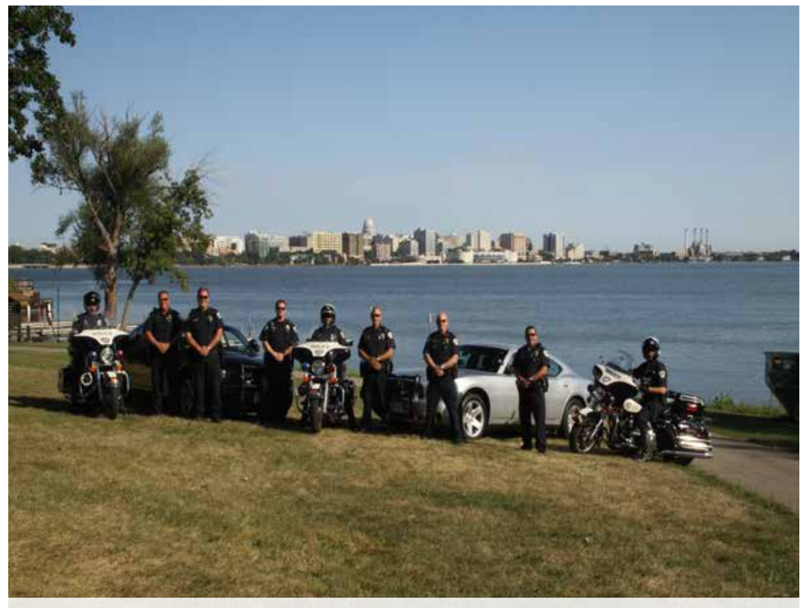
Traffic Enforcement Safety Team (TEST)