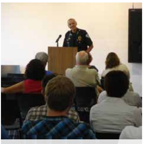
Chief's Community Forum

MPD NEXT STEPS: MPD attends staff meetings on future development projects within the City. Information is shared with the affected district so that further input and collaboration can occur on the project proposal. MPD also participates in the Neighborhood Resource Teams (NRT) throughout the City.