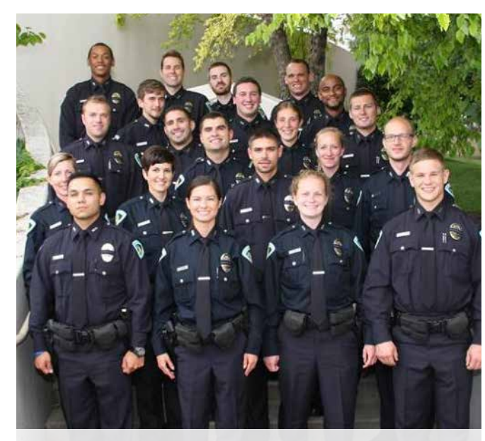
2015 Recruit Class

MPD NEXT STEPS: Celebrate the diversity of MPD.