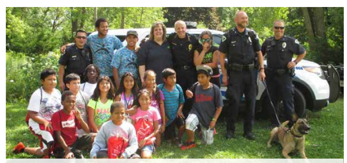
Allied Drive Summer Camp Program

With the implementation of our grant-funded Community Outreach and Resource Education (CORE) team slated for June of 2016, and a second grant to add staff to this team in June of 2016, we will be able to more consistently create opportunities in schools and communities for positive non-enforcement interactions. The CORE team will facilitate already existing outreach efforts such as our Citizen Academy, Youth Academies, Explorer Post, and Amigos en Azul. CORE will further concentrate outreach initiatives to youth, particularly children in middle school.