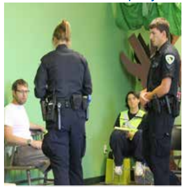
Mental Health Training

Our Officer-Involved Critical Incident procedure addresses the unique concerns of officers and employees who have been involved in a critical incident as a witness,