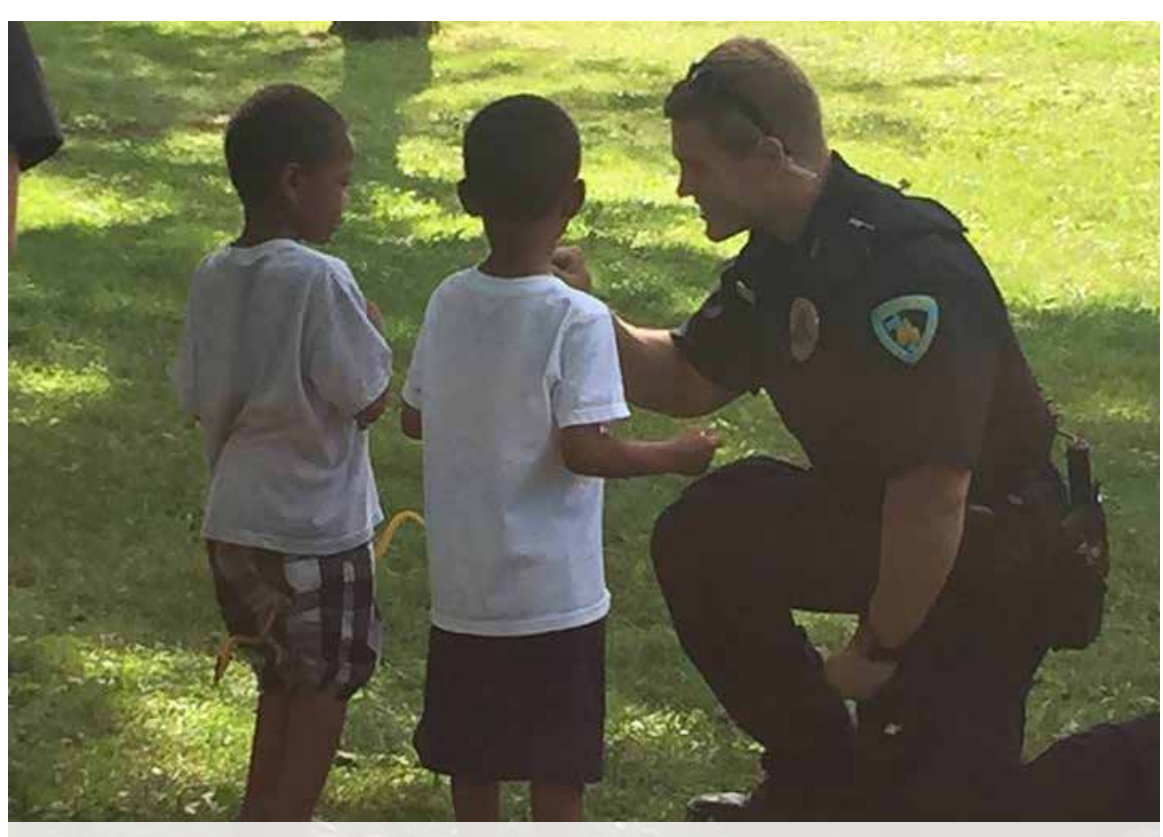
Meeting Community Members

MPD NEXT STEPS: The Madison Metropolitan School District has developed comprehensive programs to address these issues. MPD continues to support these efforts. MPD would also welcome additional community based programs for youth.