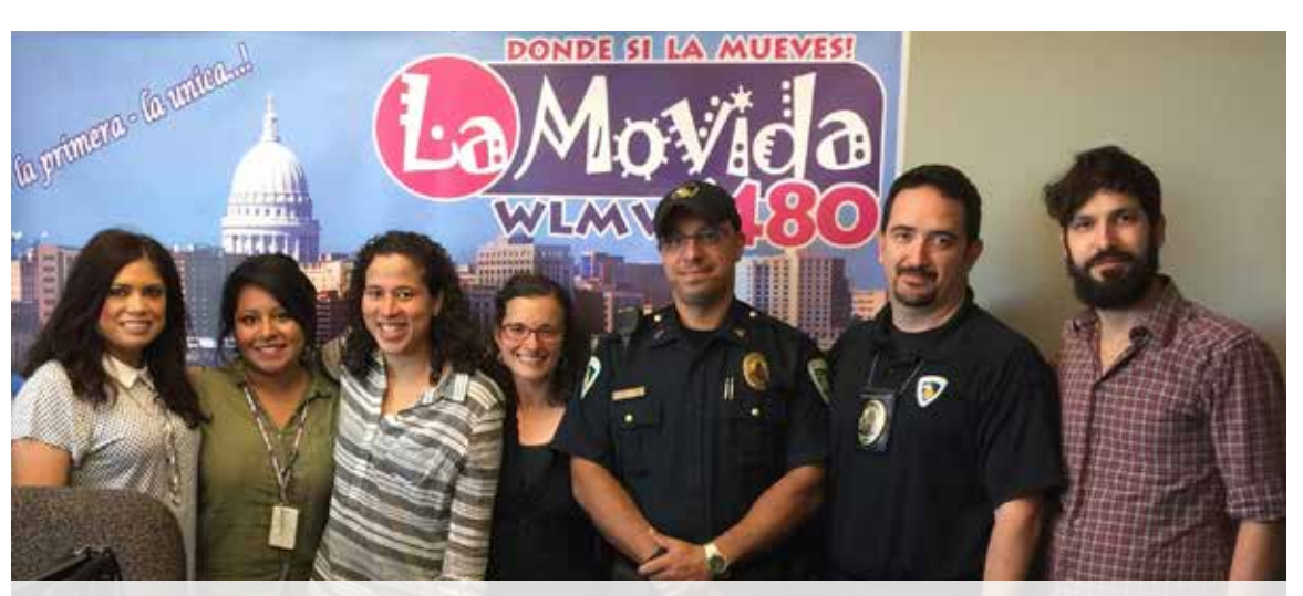
La Movida El Debate Show Promoting Soccer Series

Information regarding serious officer misconduct is currently released via a detailed case review at the point that the release will not compromise potential criminal or internal discipline processes.