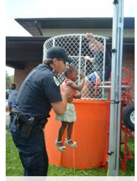
Eastside Community Fun Fest

MPD also provides outreach programming to many immigrant communities. MPD's Amigos en Azul program, active since 2002, continues to provide extensive programming for the Latino community. In addition, officers from across the Department attend numerous meetings, festivals,