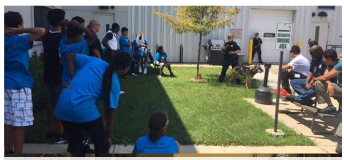
Black Youth Academy

MPD regularly analyzes overall patrol workload and attempt to staff patrol in a way that provides officers with time for proactive activities. Officers are encouraged to engage in community interactions outside of responding to calls for service.