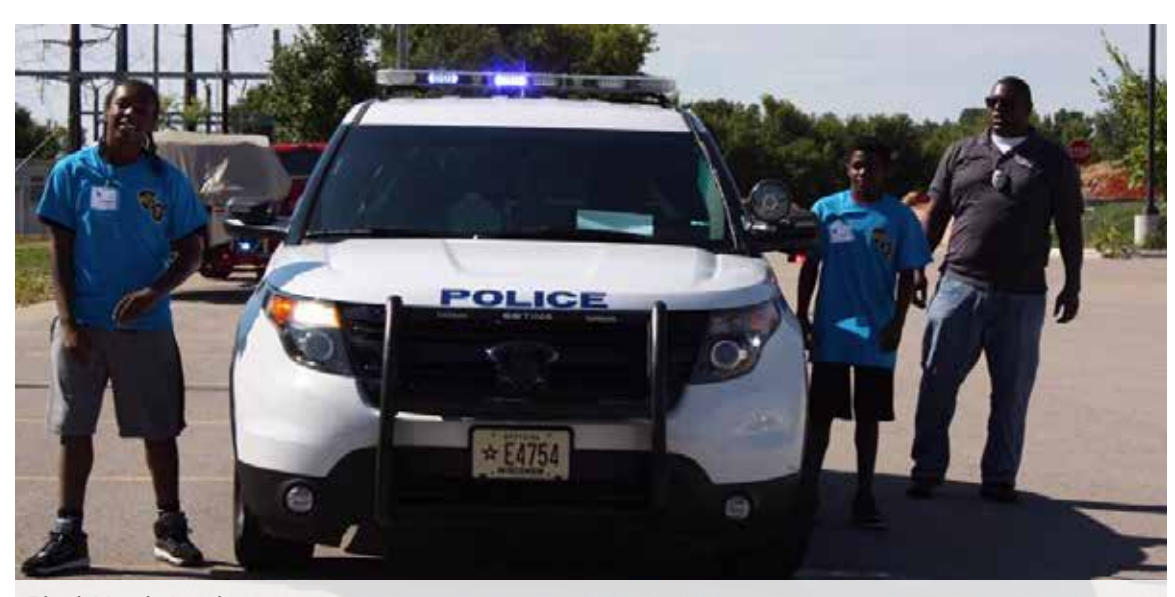
Black Youth Academy

MPD NEXT STEPS: Continue with current efforts. MPD has a Peer Support Program and Employee Assistance programs to provide trauma support to first responders. For community members the Dane County Victim-Witness Program provides support during major cases.