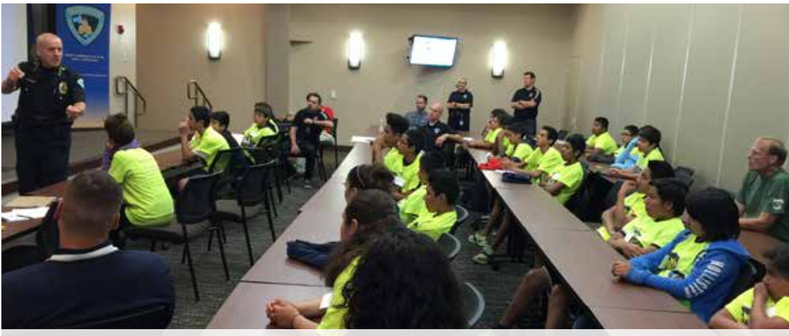
Latino Youth Academy

The Professional Standards and Internal Affairs (PSIA) Office sends out quarterly discipline summaries to all of the area media outlets. These summaries include all of the officers who were disciplined each quarter and a short summary of what they were disciplined for. In higher profile, more public type of cases, the PSIA office may send out a separate media summary with a summary of the incident and what the officer was disciplined for.