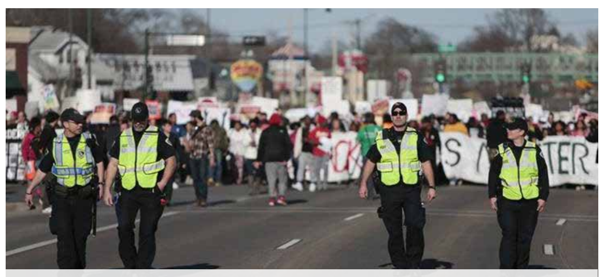
Special Events Team (SET)

The U.S. Department of Justice, through the Office of Community Oriented Policing Services and Office of Justice Programs, should provide technical assistance and incentive funding to jurisdictions with small police agencies that take steps towards shared services, regional training, and consolidation.