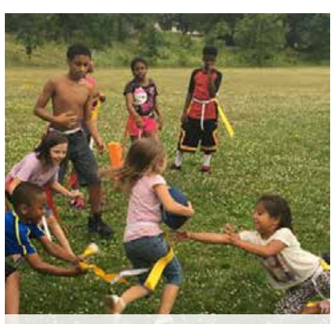
Flag Football Event