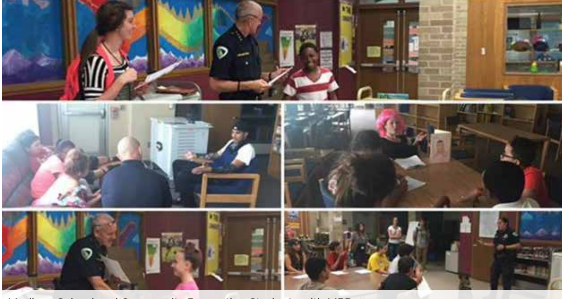
Madison School and Community Recreation Students with MPD