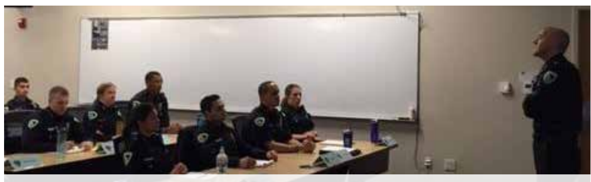
Recruits in Training Academy

MPD NEXT STEPS: The Madison Police Department received a COPS grant to create a new Use of Force Coordinator position. This position will be responsible for reviewing all Use of Force reports, identify training needs for individuals and department-wide trends, responding to community/citizen inquiries related to use of force to include attending community meetings, updating the use of force SOPs and for determining the best way to disseminate information to the public.