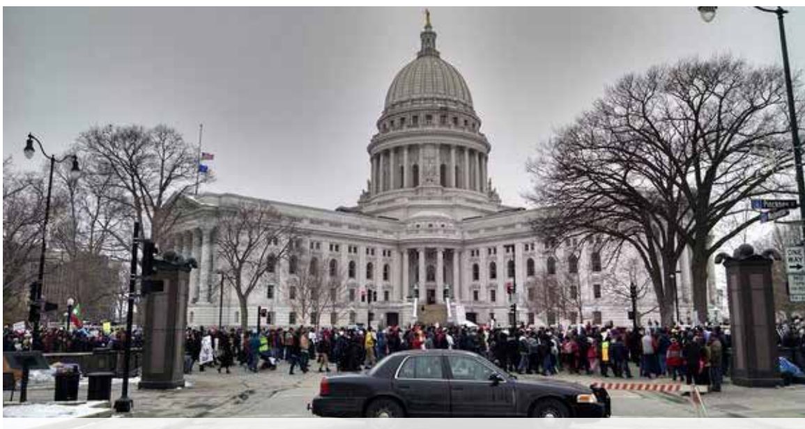
"A Day Without Latinos and Immigrants in Wisconsin" Rally