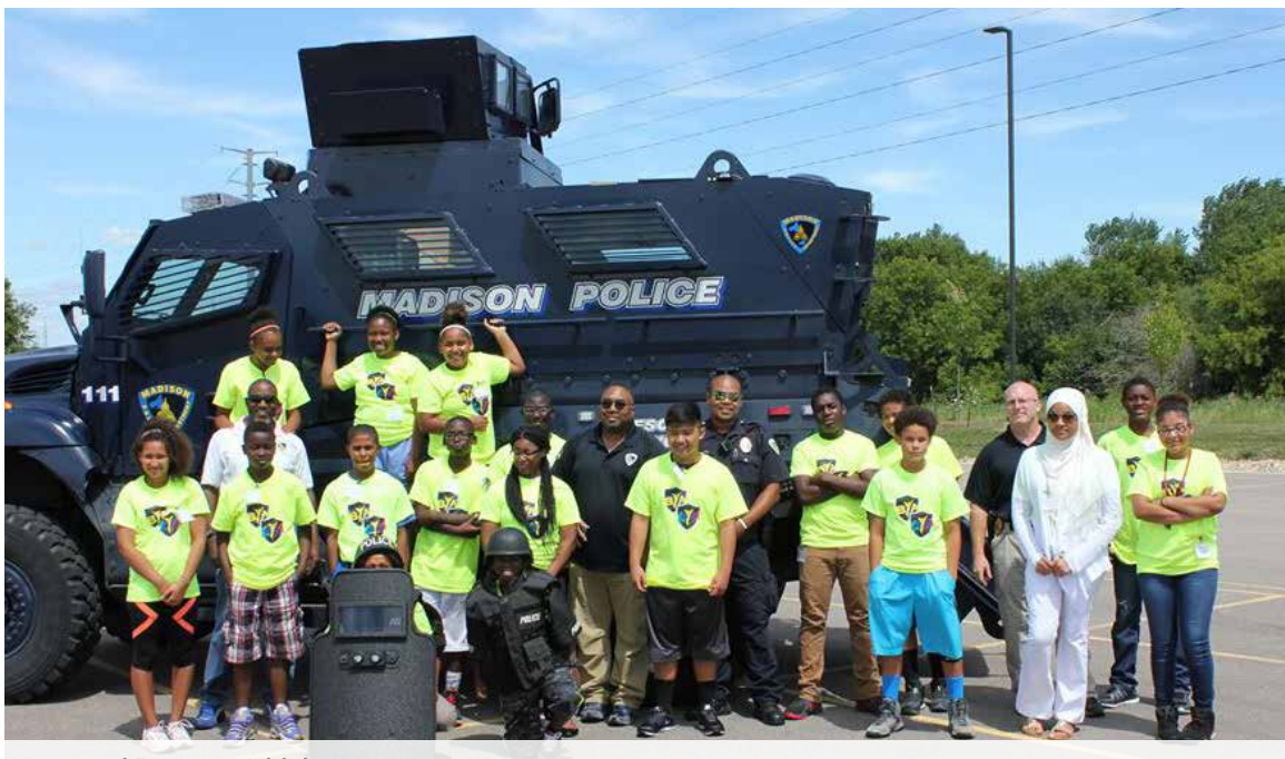
Armored Rescue Vehicle