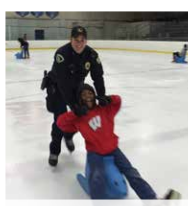
Skating with a Cop

MPD NEXT STEPS: Corporal punishment is expressly prohibited, and schools do not use electronic control devices. See MMSD Policies and Procedures: 4221 Use of Restraint and/or Seclusion.