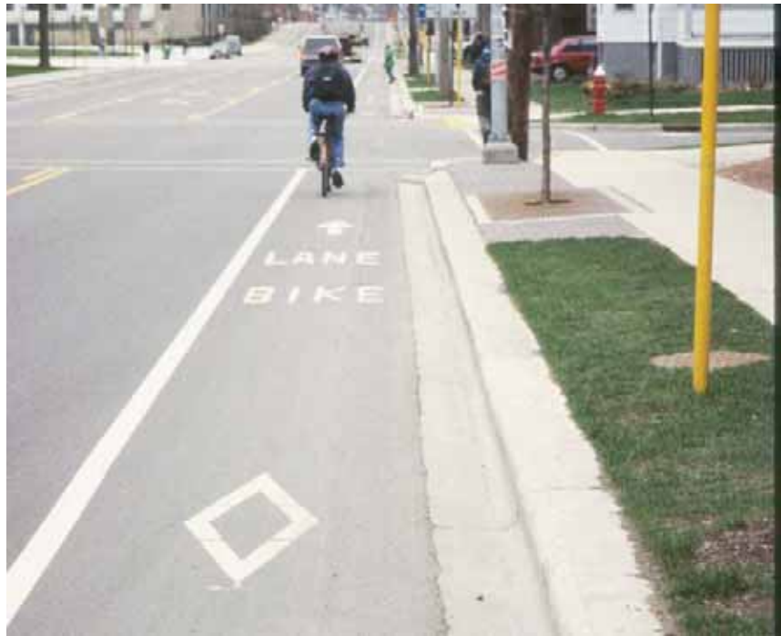
A complete street in Madison.

Madison has made many positive strides toward complete streets over the years, but now it is time to formalize the policy and implement it in a manner that will make our community a leader in the nation.