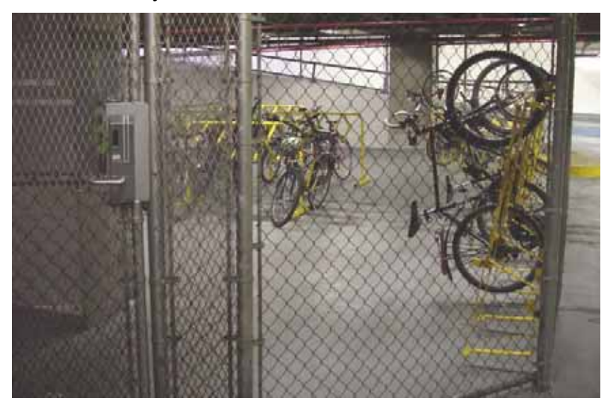
Bike Cage.