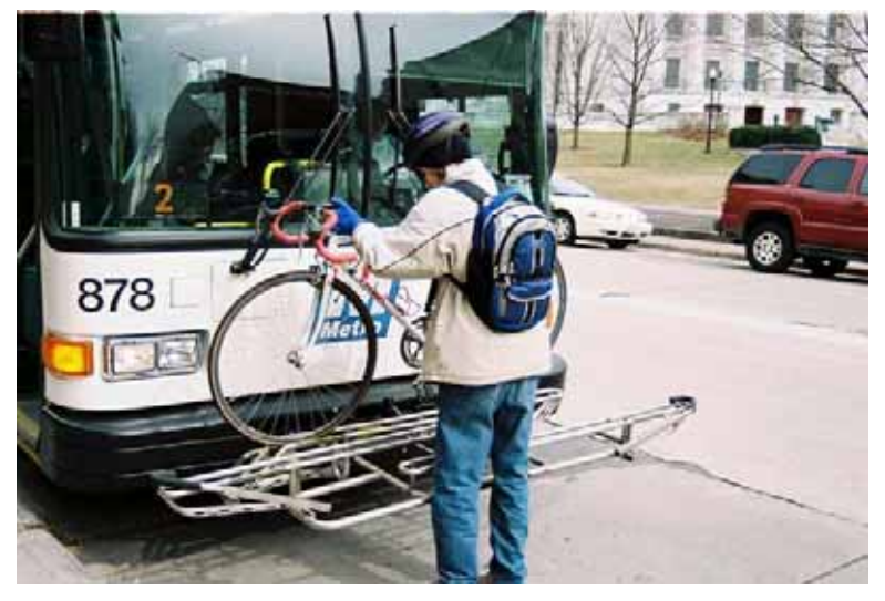
Bike Rack on Madison Metro Bus.