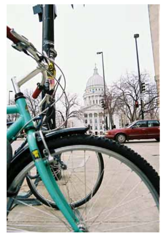
Bikes around the capital building..