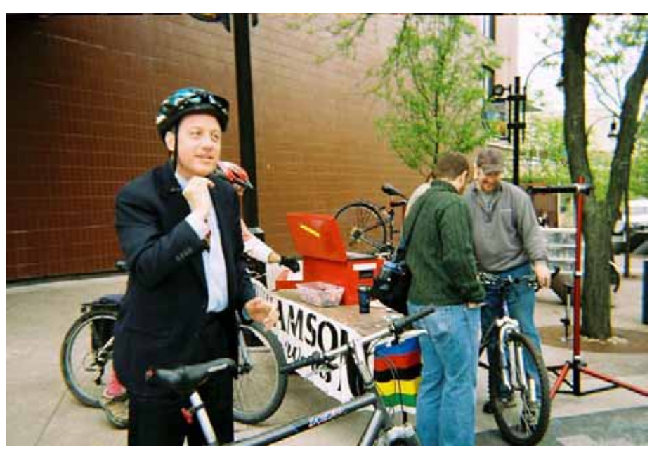
The Mayor arrives at Bike to Work Week press conference.