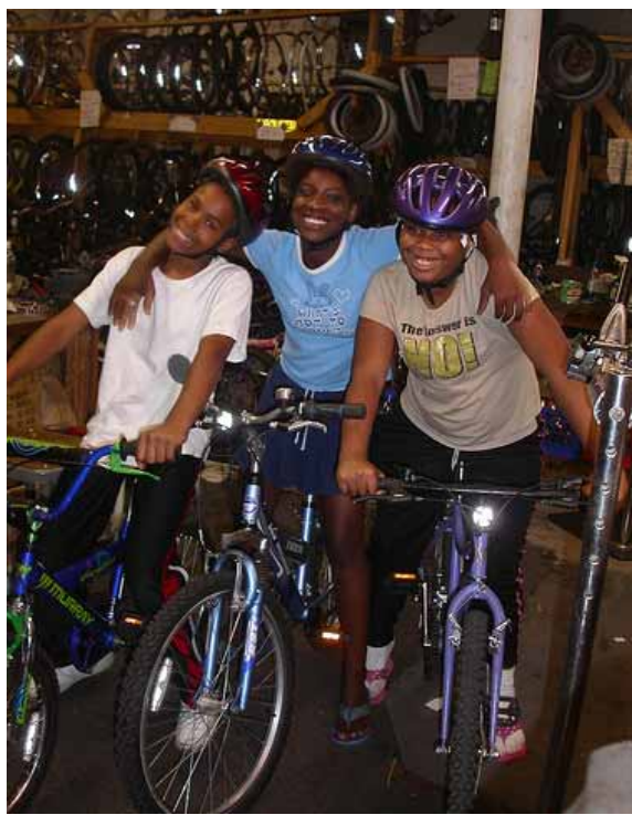
Some Madison girls pick up their Earn-a-Bikes.