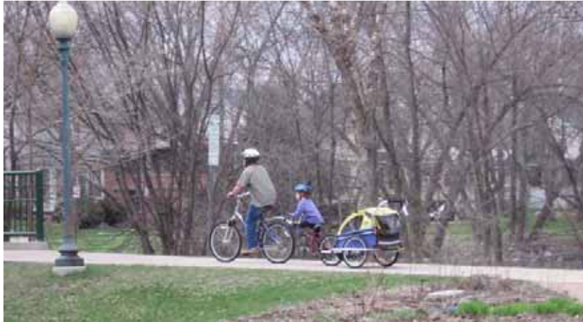
A family bicycles on Madison's east side.

Resources: Funding to come initially from the corporate sponsorships of the Platinum Committee. If successful, seek additional funding from the city or businesses