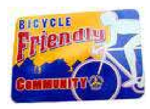
Example of Bicycle Friendly Community Sign.