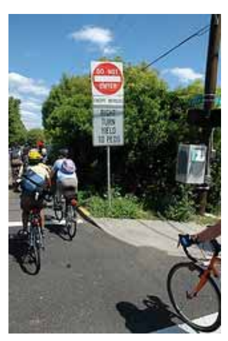
Bike Boulevard.