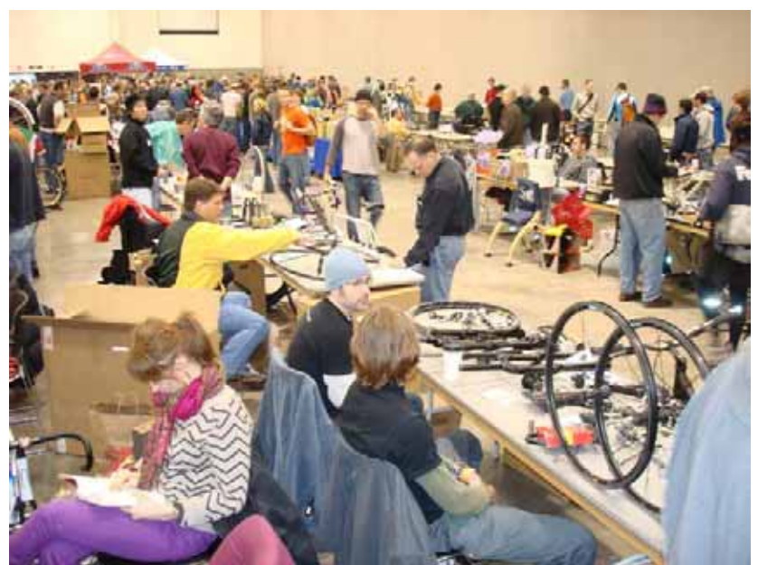
Cronometro's annual bike swap for the Brazen Dropouts Racing Club.