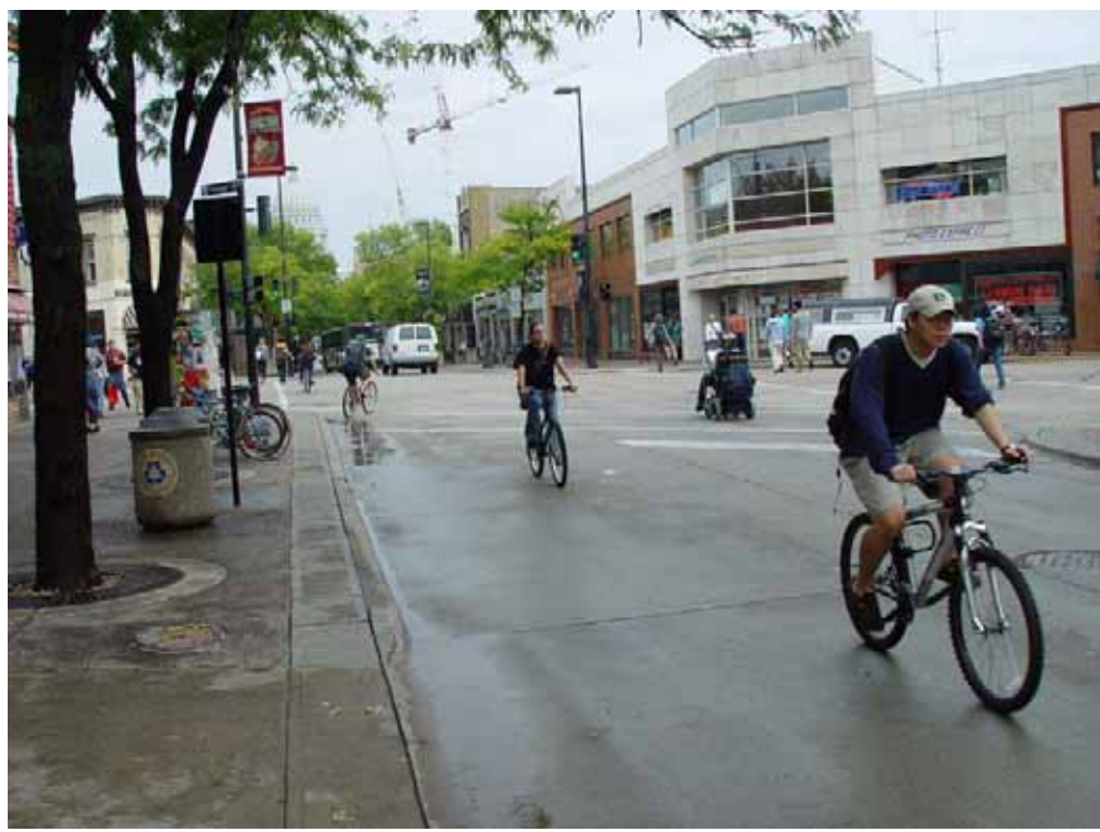
Madison's State Street, which is closed to through automobile traffic.

Madisonians enjoy and value a high quality of life. Better conditions for bicycling and walking have tangible and intangible benefits to the quality of life. In cities where people can regularly be seen out bicycling and walking, there is a palpable sense that these are safe and friendly places to live and visit. Bicyclists are an indicator of quality of life, the proverbial "canary in the coalmine." A contributing factor towards preserving and improving Madison's high quality of life is making the City even more friendly to bicycling.