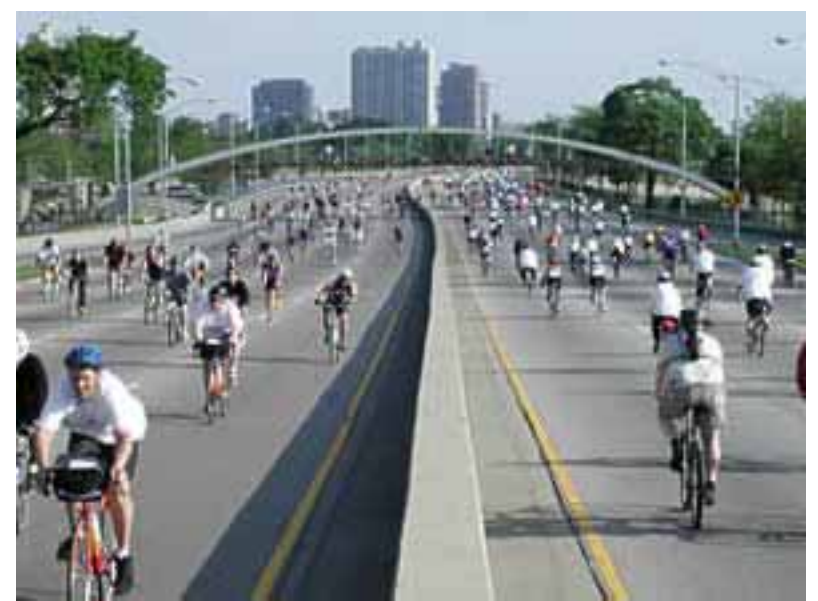
Bike the Drive in Chicago (an event similar to Sunday Parkways).

Resources: Staff, police time, and volunteers