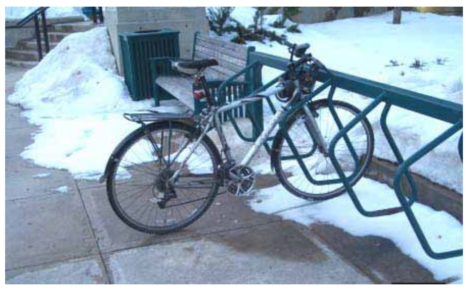
Bike Rack in Winter. Image: Arthur Ross