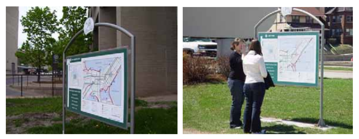
Wayfinding signs.