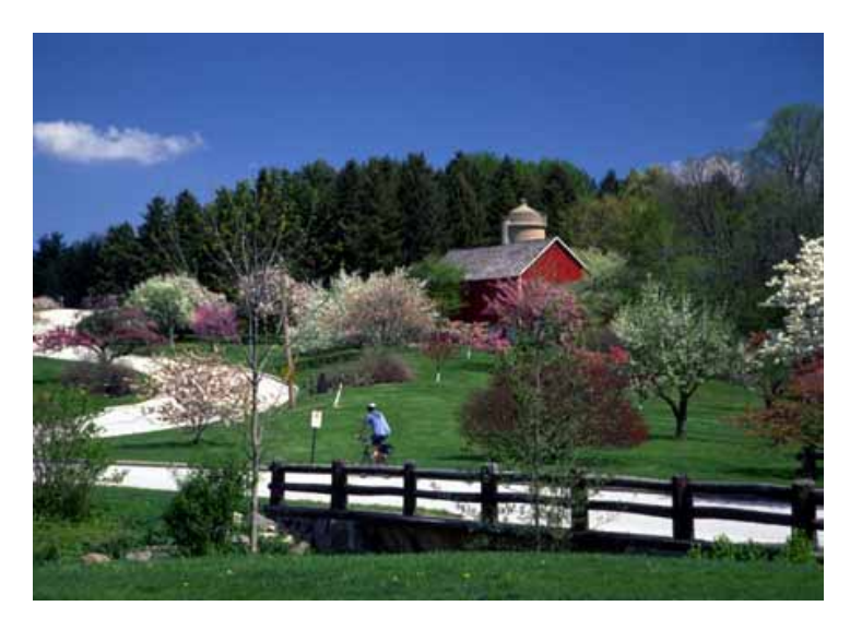
Rural Biking Scene.