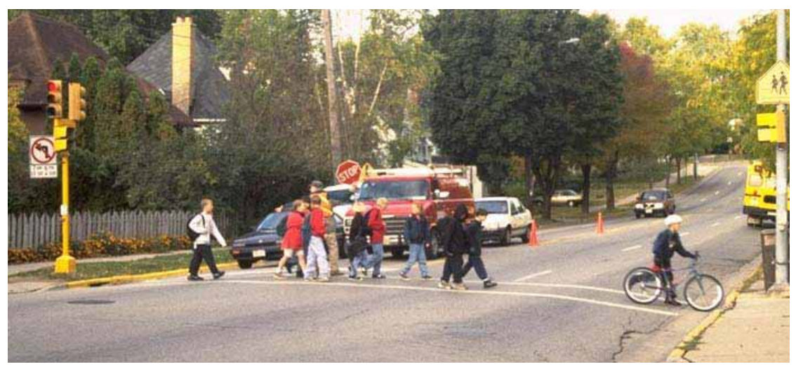
Kids heading to school.

Over the last several years an international movement has developed called Safe Routes to School, which seeks to improve children's ability to bike or walk to school by improving engineering, enforcement, education, encouragement, and evaluation. Though Safe Routes to School is a program or a combination of programs and policies that can be implemented, the Platinum Committee felt that it is also a theme that should be considered whenever improvements for bicycling and walking are discussed or made. All of the components of Safe Routes to School are incorporated in this report, though they are not always directly identified as such.