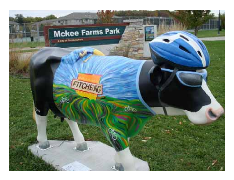
Fitchburg Bicycling Art Cow.

Finally, Madison is home to a significant percentage of the nation's bicycling industry. Improving bicycling conditions will increase the number of bicycle riders, and thus increase the direct and indirect positive economic impacts of the bicycling industry on the local economy.