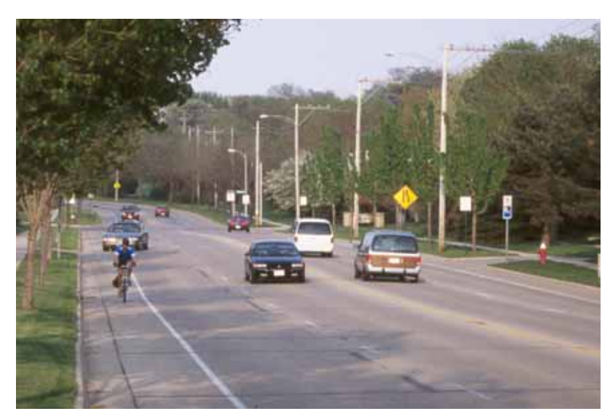
Bike lanes are a typical improvement for arterial streets.