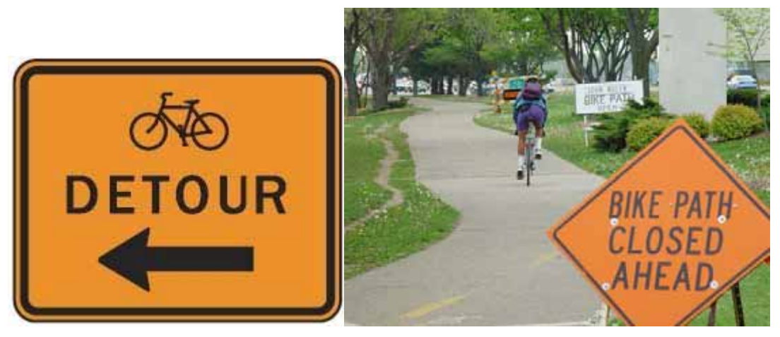
Bicycle Route Detour Sign. Image: Arthur Ross