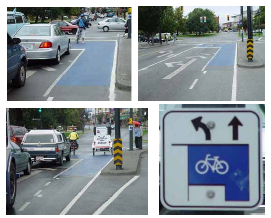
Bike Box, Victoria, BC.