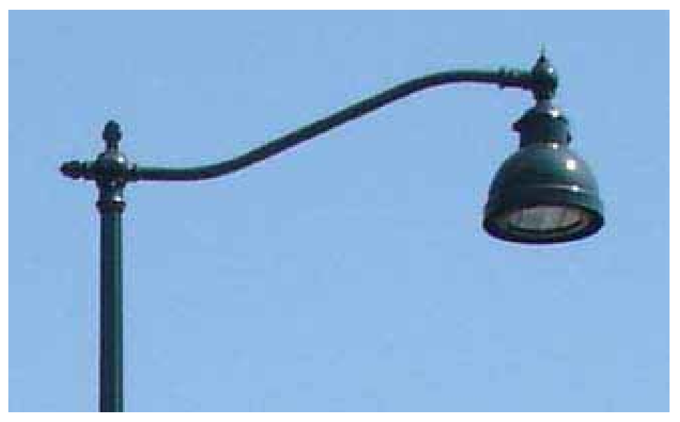
Cut off lighting on E Washington Avenue.

Resources: Staff time and cost of sign installation