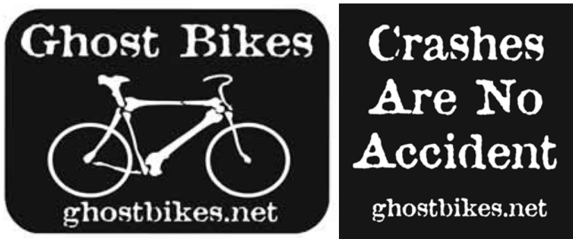
Ghostbike Project.