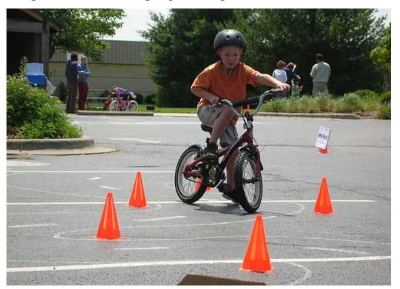
A child learns better bicycling techniques.

Resources: Depends on level of program implemented