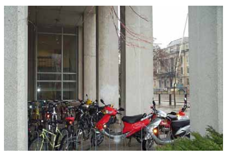
Mopeds parked at bike racks.