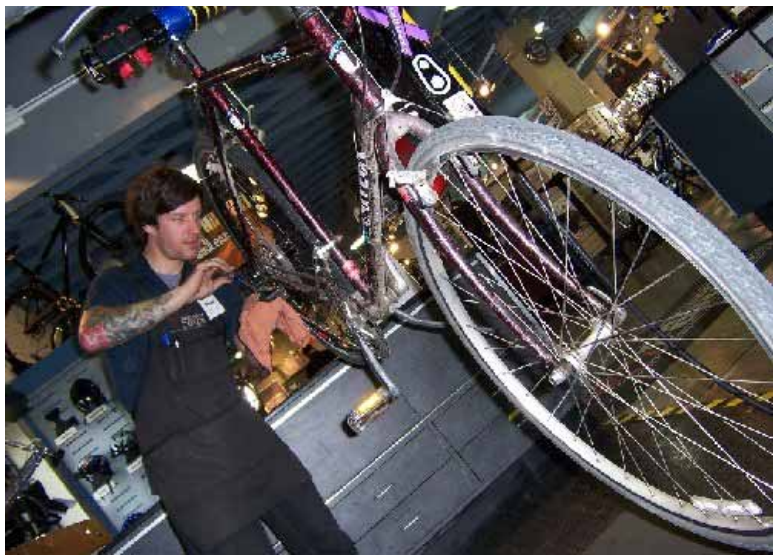
A mechanic at a Madison bike shop.