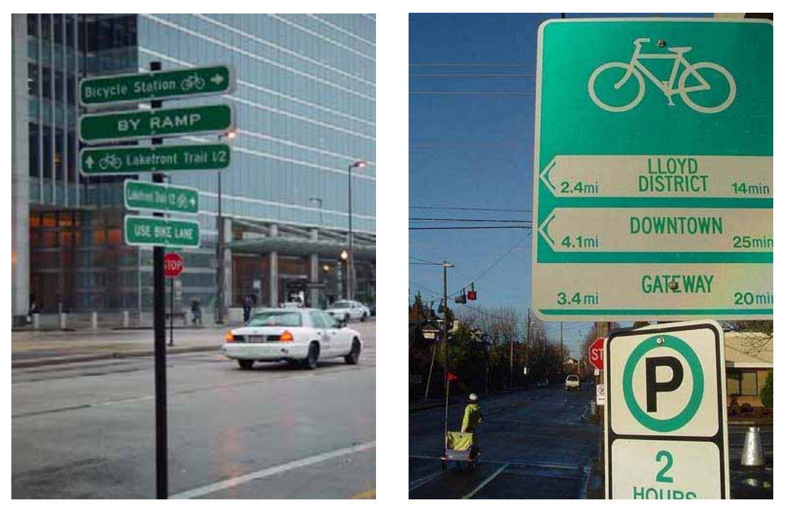
Examples of Destination Based Bike Network Signs (Chicago left, Portland right).